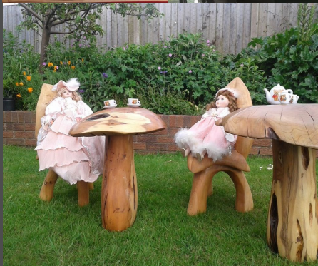
Nick Lumb of Acorn Furnishing donated 2 carved pixie chairs and toadstool