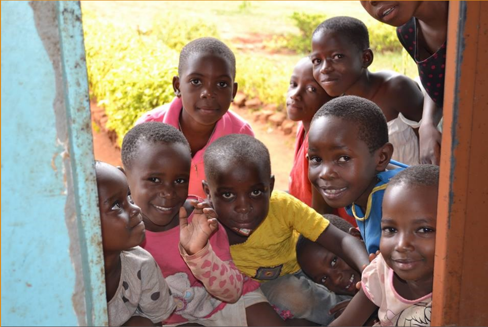
School children at Jack Standard school in Uganda.