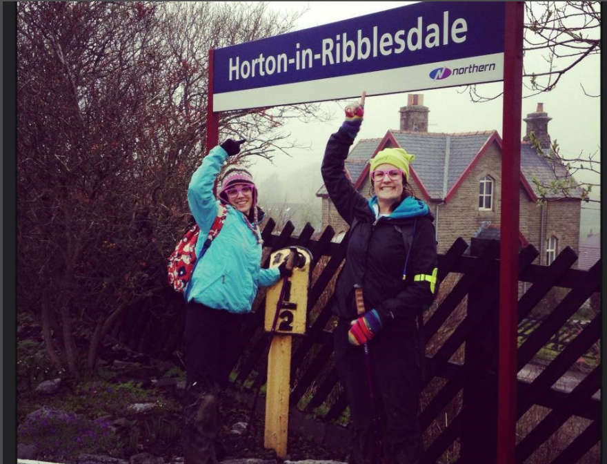
“Almost back to base camp . . . just down the hill to go!”